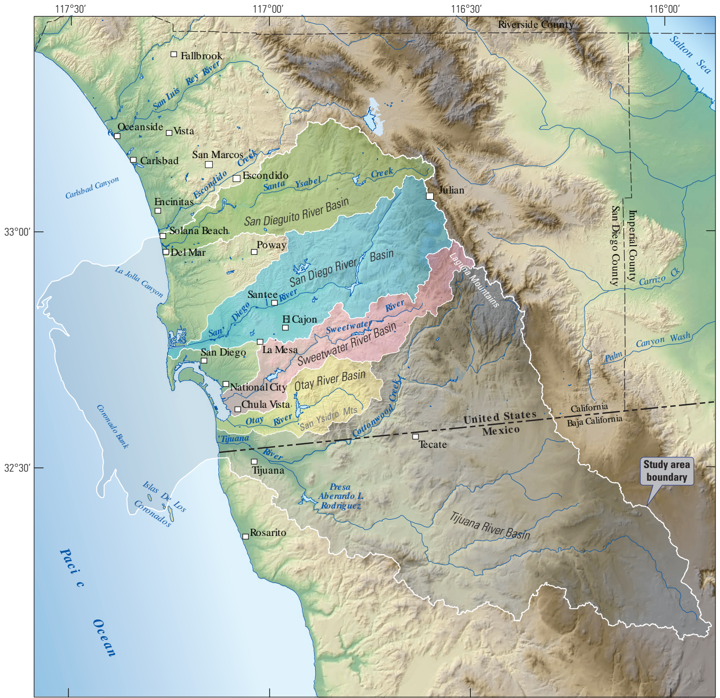
Shaded relief base from U.S. Geological Survey digital elevation data, 1:24,000-scale