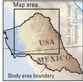
Figure 10. Locations of 216 non-USGS groundwater sites in San Diego County, California, 2001–2020. Refer to table 1.7 for specific data that are available for each site.